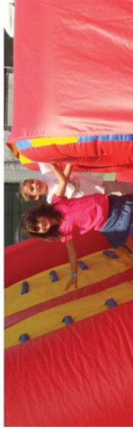
Bounces, face-painting, QB Blitz, cookie decorating!