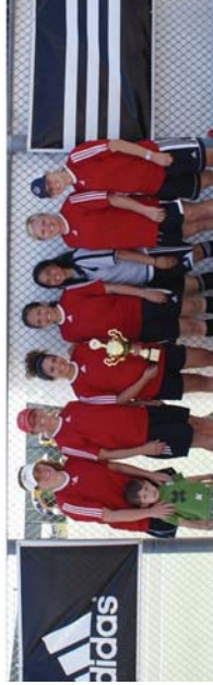
Awards for all divisions!