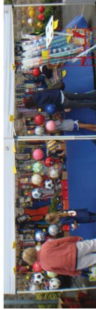
Vendor Village – grab a bite, shop, and explore!