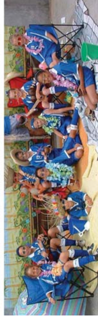
The Click for a Cure photo booth!